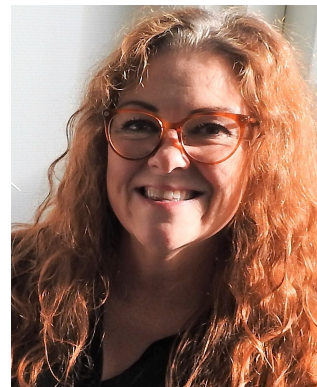
← Johanna Communications